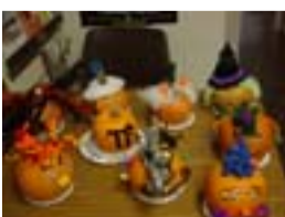
Pumpkin Decorating Contest