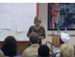
Learning Styles Seminar