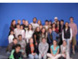
To Do Show